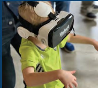
VR GOGGLES presented by Findorff