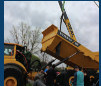
BIG EQUIPMENT presented by Ideal Crane/Airings

Our APPRENTICE SECTION will focus on youngsters, ages 4-8, while our JOURNEYMEN SECTION will focus on kids ages 8-12. A Majority of our attendees are in the apprentice section but our goal is to achieve just as much success for the Journeymen Section.