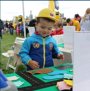
DREAM NEIGHBORHOOD presented by Veridian Homes