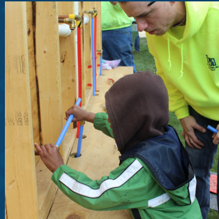
FIX THE PIPES presented by 1901, Inc.