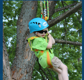
TREE HOIST presented by Conney Safety

Our APPRENTICE SECTION will focus on youngsters, ages 4-8, while our JOURNEYMEN SECTION will focus on kids ages 8-12. A Majority of our attendees are in the apprentice section but our goal is to achieve just as much success for the Journeymen Section.