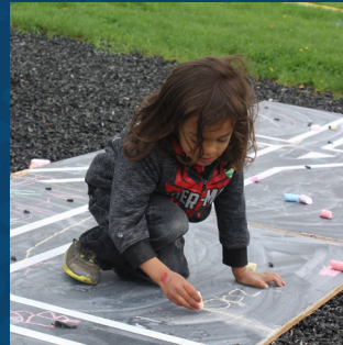
SIDEWALK CHALK CITY presented by TriNorth Builders