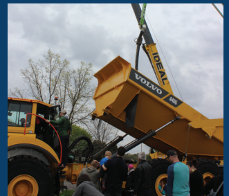
BIG EQUIPMENT presented by Ideal Crane/Airing

Our APPRENTICE SECTION will focus on youngsters, ages 4-8, while our JOURNEYMEN SECTION will focus on kids ages 8-12. A Majority of our attendees are in the apprentice section but our goal is to achieve just as much success for the Journeymen Section.