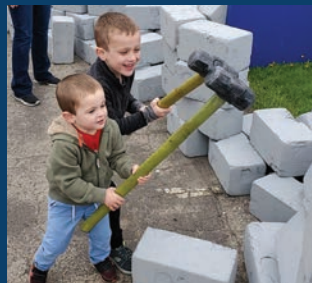
DEMOLITION WALL presented by Tri-North Builders