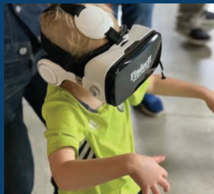
VR GOGGLES presented by Findorff