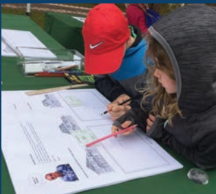
ARCHITECT STATION presented by Veridian Homes