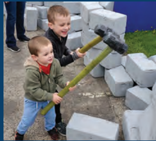
DEMOLITION WALL presented by Tri-North Builders