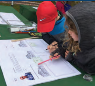
ARCHITECT STATION presented by Veridian Homes