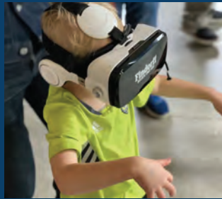
VR GOGGLES presented by Findorff